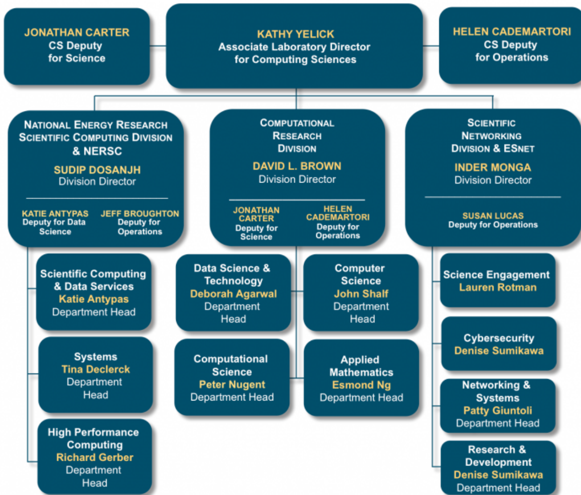
Figure 1 Computing Sciences Organization Chart

Computing Sciences offices and computer rooms are located in the Building 50-complex and in Wang Hall (Building 59) on the main Lab site. Staff also work in office and computer room spaces at the Joint Genome Institute in Walnut Creek and the computer room at the Oakland Scientific Facility (OSF), in Oakland. All three Divisions have some staff that work remotely, both in offices and in technical areas. Drop-in offices have been established in the 50-complex and at Wang Hall, facilitating flexible work arrangements and matrixing of employees. In addition, CS Area researchers collaborate with faculty and scientists located at other institutions. These collaborators may have LBNL employee or affiliate status.